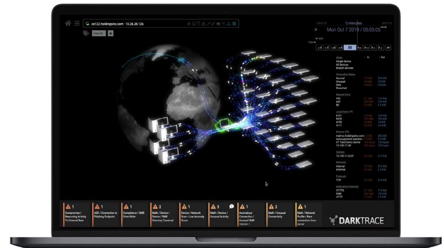
Figure 2: Self-Learning AI autonomously detecting a zero-day ransomware attack and stopping it in seconds

Conversely, Self-Learning AI is able to surface in-flight attacks that other tools miss and then take the right action, at the right time, to interrupt that attack, significantly reducing the overall risk of the organization as well as complementing existing security investments.