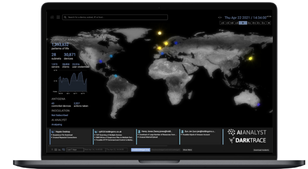
Figure 1: Darktrace provides complete visibility across the digital estate in real time