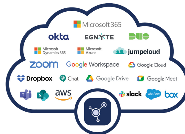
Figure 3: Darktrace's AI detects and responds to threats across the full range of cloud infrastructure and applications